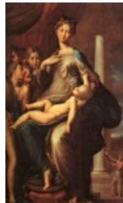
Madonna with the Long Neck Parmigianino

I thought I knew quite a bit about art history until I ran into a new term for my vocabulary. Just in case there are some others out there with this lack of knowledge I thought I would research it a bit. ed.