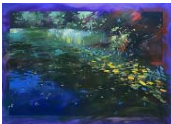
Lake In Maine 52x72

To see more of his work check out www.franksatogata.com/painting.html