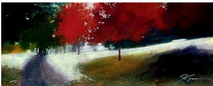
Early Snow 20x50