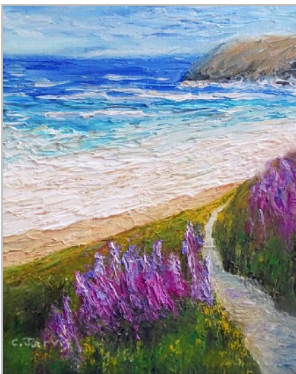
Carolyn Jarvis - FROM TOP: "Spring Bloom at the Coast" 10x8 oil "Lupines at Goat Rock" 8x8 oil oil