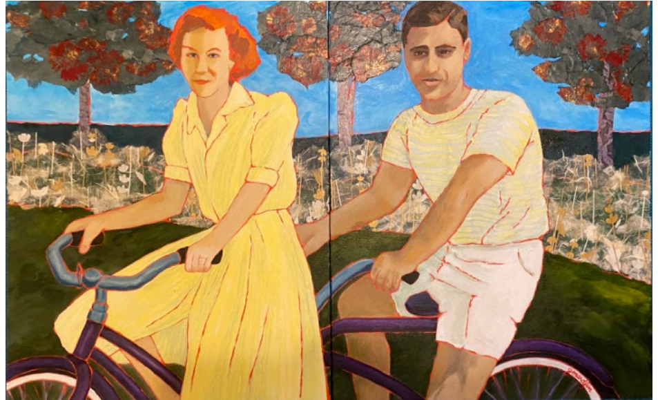
Gail Mardfin - "Rusty & Bob, 1943" 20x32 acrylic & collage diptych This is based on a small, fuzzy, black & white photo I have of my parents - still working on the man's face a bit, but I thought it tied in with the month's prompt. I am working on a series of 12 paintings of people for a show in January at Moonlight Brewing.