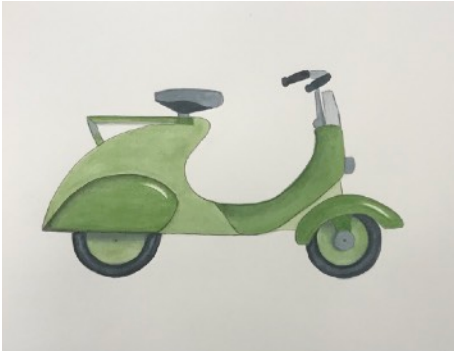
Marilee Wingert - "Vespa" 7x9 watercolor