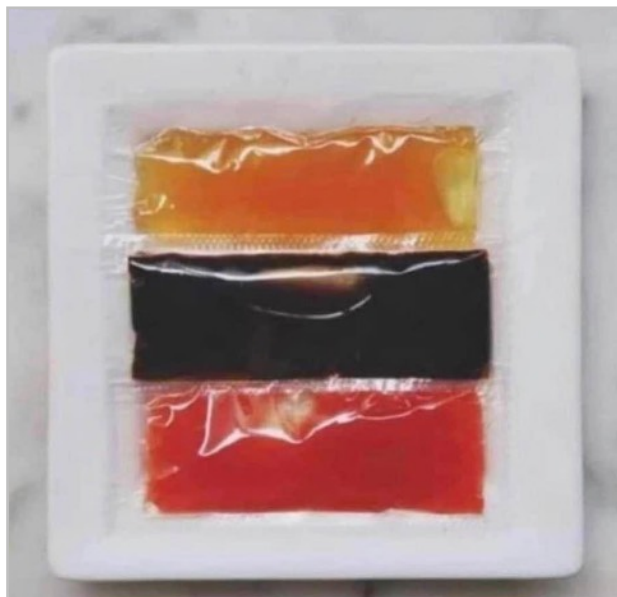
Mark Rothko... the Take Out Years