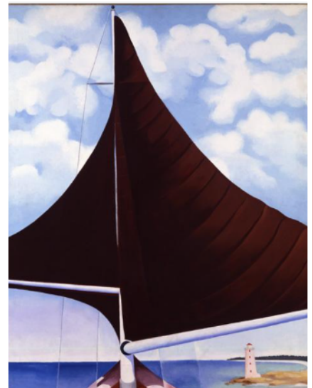
Georgia O'Keeffe - "Brown Sail, Wing and Wing, Nassau" 38x30 oil, 1940