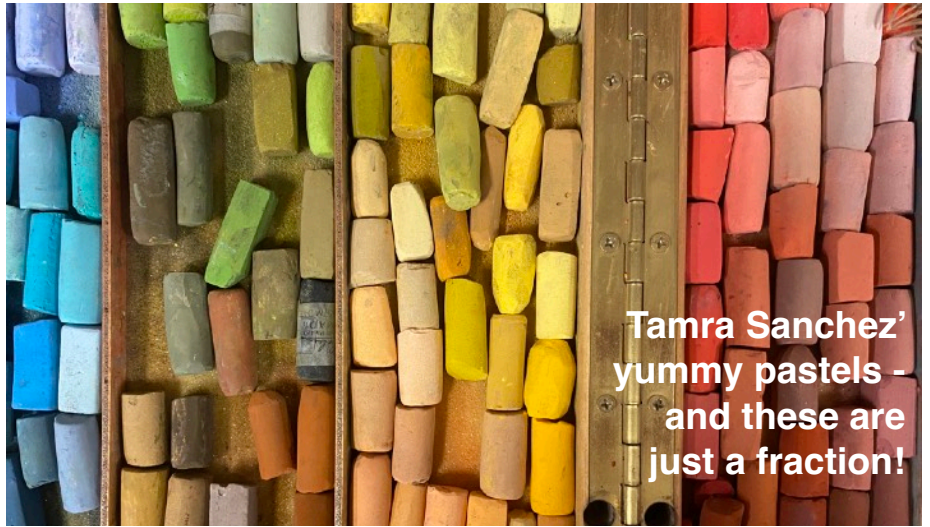
Tamra Sanchez' yummy pastels - and these are just a fraction!

Our September demonstration was given by Tamra Sanchez , who uniquely demonstrated pastels by painting two paintings of the same landscape on different colored backgrounds (one light and one dark). It was fascinating to see the difference and to hear different members say which one they preferred. She described her processes and techniques and let us see them as she created two amazing paintings. It was delightful. (See Beverly's article on page 11.)