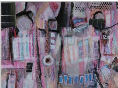
Nancy Tulloh - FROM TOP: "Views" 18x24 acrylic; "Urgent" 12x16 mixed media; "Spring" 14x16 mixed media