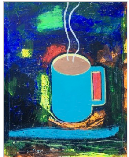
Sandi Maurer - FROM TOP : "Cup of Inspiration" & "2nd Cup" Both 20x16 acrylic